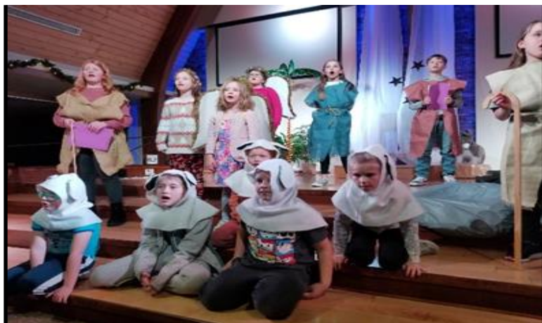
Costumed children depict the nativity scene and sing "Joy to the World" during their Christmas Program December 14, 2022.

"JOY to the world, the LORD is come..." sung by the JAM kids during the Christmas program on December 14.