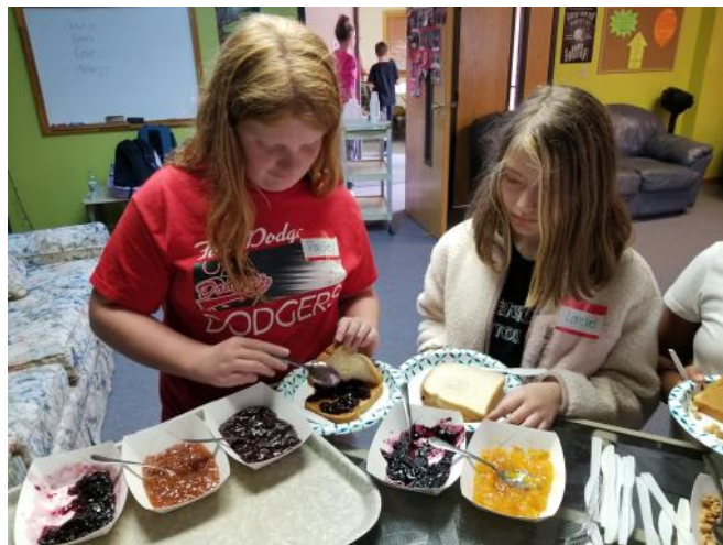
#8 Choosing toppings for peanut butter sandwiches during Stop & Go Supper.

8 PEANUT BUTTER TOPPINGS! Stop & Go supper invited guests to create their own Peanut butter and [blank] sandwich to teach the Bible verse, Proverbs 18:24, "A true friend sticks by you like family."