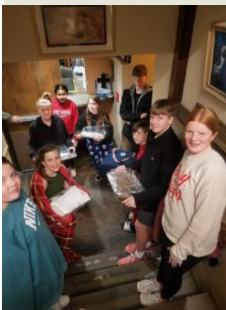
Youth group made and delivered a meal to The Beacon.