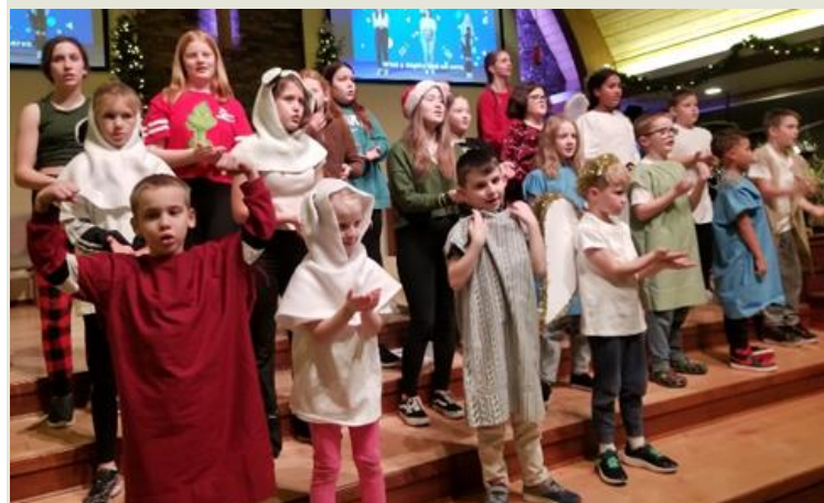
The JAM kids end with "What a Mighty God we Serve"!